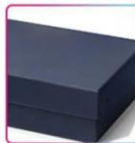
Soft Touch Laminate